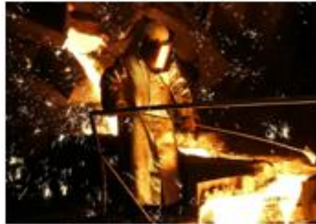
TiZir Tyssedal - inntil 261 mill. kroner