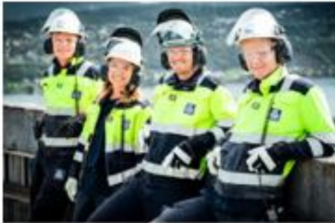
Yara International - inntil 283 mill. kroner