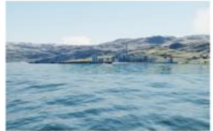
Horisont Energi - inntil 482 mill. kroner